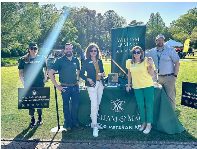
Military & Veteran Affairs Team at the OTOD Carnival

W&M celebrated One Tribe One Day April 18 and we are so grateful to everyone who gave to the Military & Veteran Affairs fund! For the first year ever, Military & Veterans Affairs celebrated with a table at the OTOD carnival and gave out 225 temporary W&M Camo tattoos and gift bags to students and alumni. We heard so many stories from students about their veteran family members, with a lot of students receiving their parents' GI Bill. Being there really solidified the important work we are doing to build community among our tribe of active- duty, veterans and the military connected community.