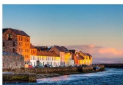
W&M summer program in Galway, Ireland

W&M students are expressly forbidden from using drugs, regardless of whether drugs are legal in your host country. In addition, many countries have more severe punishments regarding drugs than those in the United States, and while abroad, you are subject to the punitive measures of your host country. Should you be arrested on drug charges, there is nothing that the U.S. government or W&M can do to exempt you from your host country's legal process. Keep in mind that while U.S. law dictates "innocent until proven guilty," many other countries do not adhere to the same standard and may have harsher penalties.