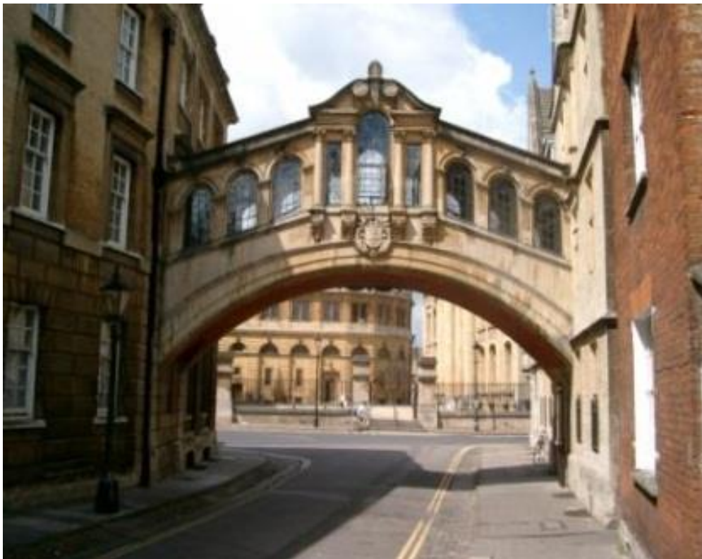
Hertford College, Oxford University

If you plan to travel while you are abroad, you should find out whether tourist or student visas are required for the countries you intend to visit. If so, they may be obtained from each country’s embassy or consular office. It is wise to investigate visa regulations before you depart the U.S., so that you are aware of how much time to allow for the process. GEO does not advise on visa regulations for students studying abroad, but your host institution or program abroad will often have more information about the visa application process and requirements.