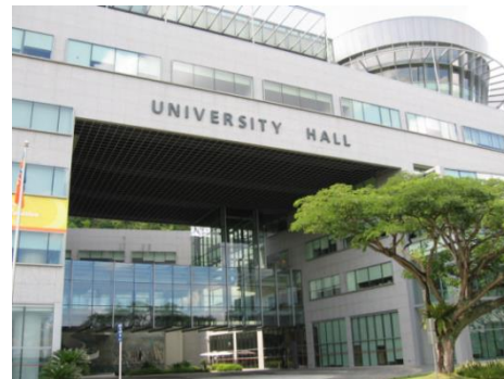
National University of Singapore