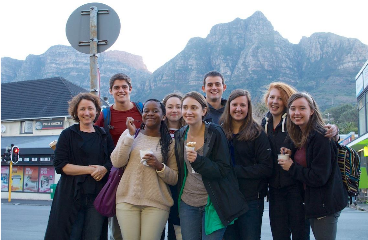
Celebrating July 4 th with ice cream in the W&M 2013 Cape Town program

You will need to provide us with the list of courses for which you wish to register. You will need to provide your name, student ID number, the day and time your window opens, course titles, course numbers, and 5-digit CRNs. Please indicate if your desired course requires instructor permission and be sure that, if so, you have obtained this permission in advance. Have a few alternate courses in mind, listed in order of preference. The Global Education Office cannot register you if you have holds on your student account; in addition, they do not have priority access to Banner, and must complete registration during the students' assigned registration windows. Students will be registered in the order in which the Global Education Office receives course preferences.