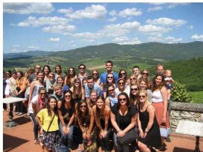
Program in Florence, Italy, visiting the Verrazzano Vineyard