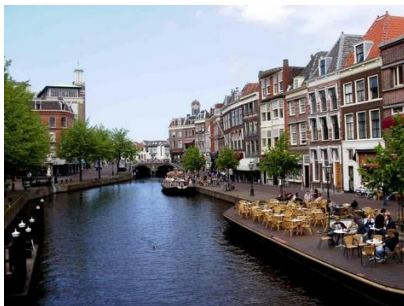
Leiden, Netherlands (left)