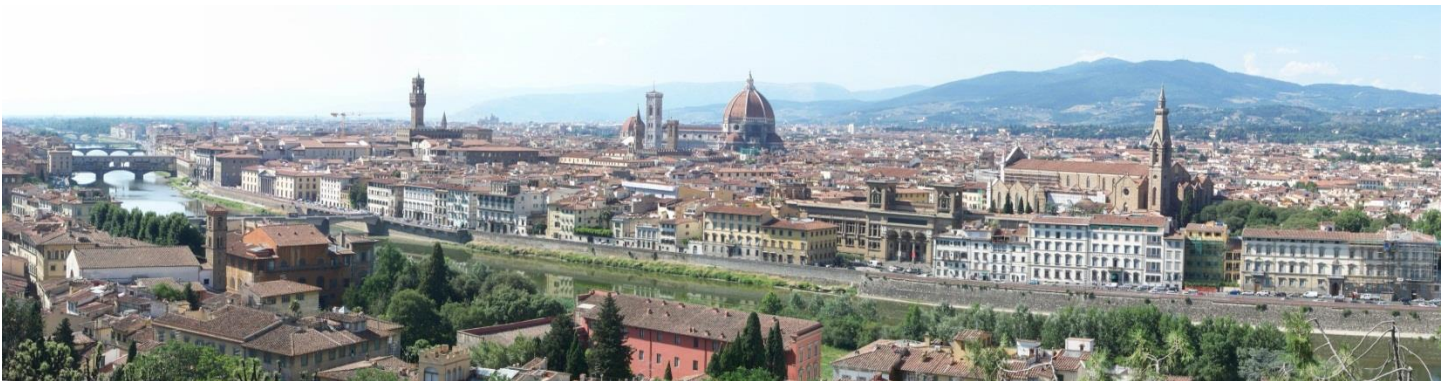
Piazzale Michelangelo, Florence, Italy

Students studying abroad may store their belongings on campus, subject to certain restrictions. Please read more on the Office of Residence Life website www.wm.edu/offices/residencelife/oncampus/openclose/storage/index.php