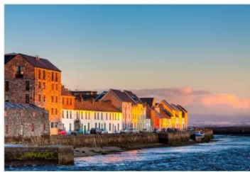
W&M summer program in Galway, Ireland

W&M students are expressly forbidden from using drugs, regardless of whether drugs are legal in your host country. In addition, many countries have more severe punishments regarding drugs than those in the United States, and while abroad, you are subject to the punitive measures of your host country. Should you be arrested on drug charges, there is nothing that the U.S. government or W&M can do to exempt you from your host country's legal process. Keep in mind that while U.S. law dictates "innocent until proven guilty," many other countries do not adhere to the same standard and may have harsher penalties.