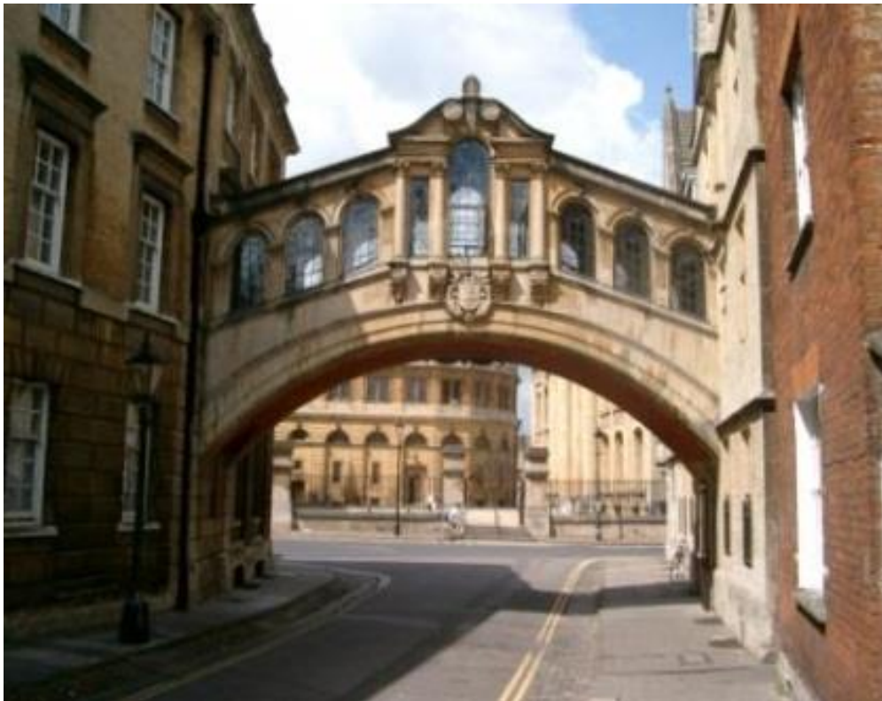
Hertford College, Oxford University

If you plan to travel while you are abroad, you should find out whether tourist or student visas are required for the countries you intend to visit. If so, they may be obtained from each country’s embassy or consular office. It is wise to investigate visa regulations before you depart the U.S., so that you are aware of how much time to allow for the process. GEO does not advise on visa regulations for students studying abroad, but your host institution or program abroad will often have more information about the visa application process and requirements.