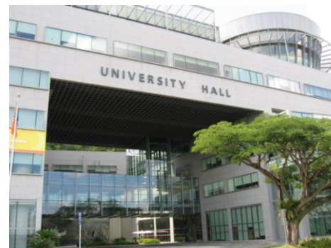
National University of Singapore