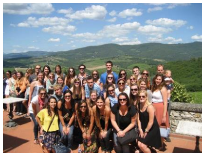
Program in Florence, Italy, visiting the Verrazzano Vineyard