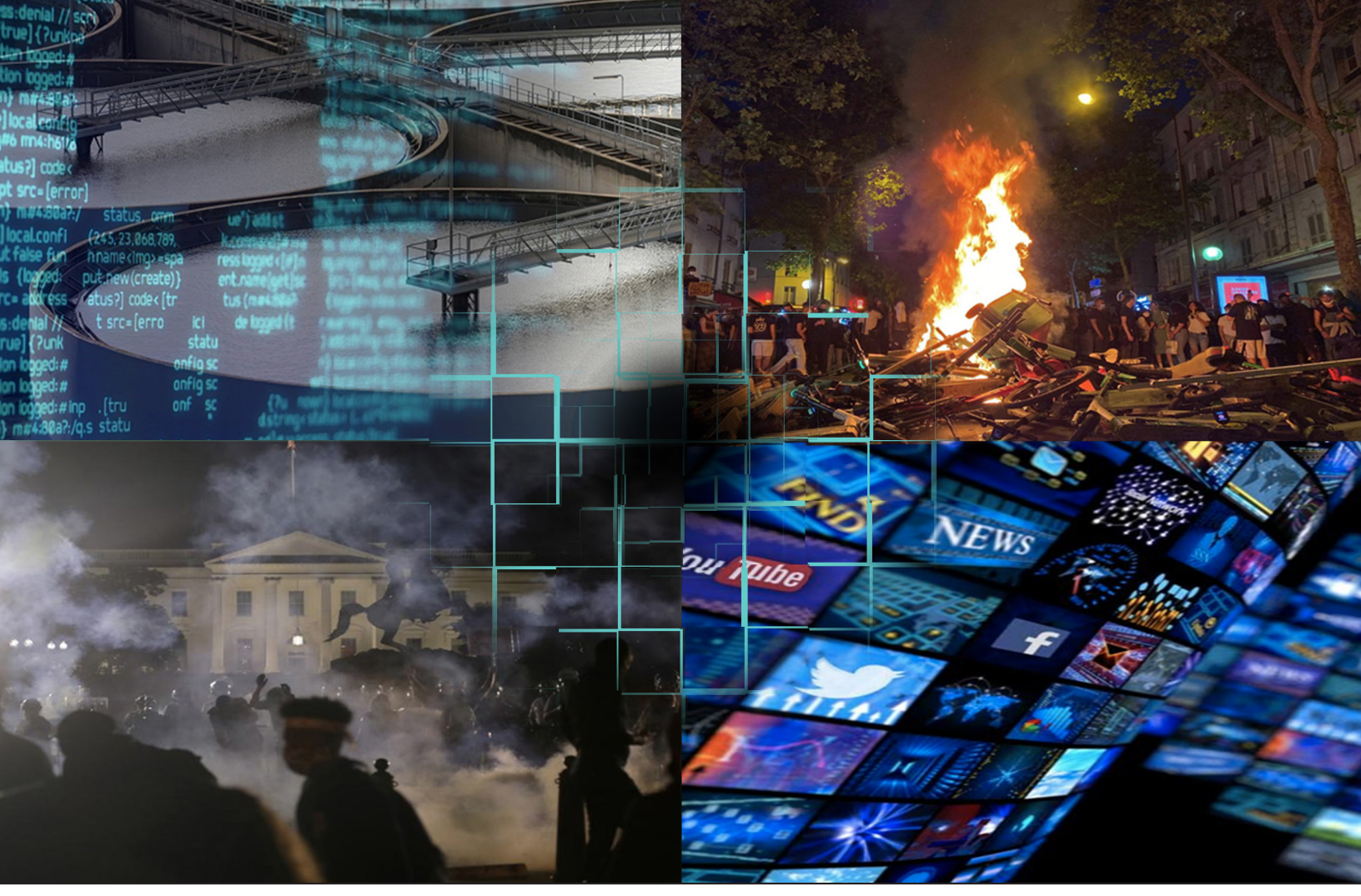
Brief No. 14.1