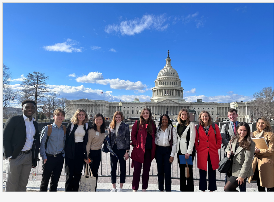
D.C. Winter Seminars Site Visit, January 2023