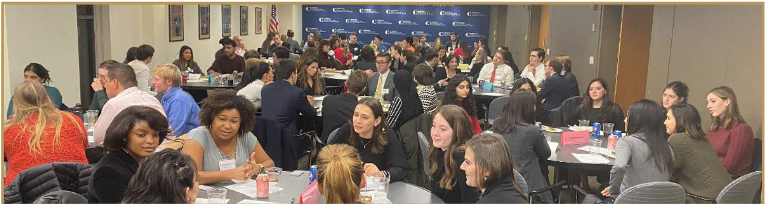
Students and alumni at the D.C. Winter Seminars Speed Networking Reception