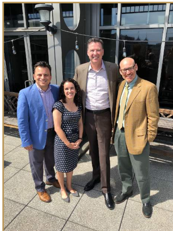
DCSI Professors with Jim Comey '82