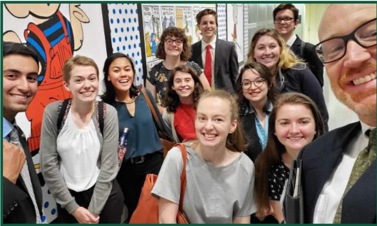
2020 News & Media students at the Entertainment Software Association

In response to the 2020 COVID-19 pandemic, the D.C. Summer Institutes moved to a completely online format, including remote internships. The two-week speaker/site visit course was conducted via Zoom and included the same opportunities as it would in-person, thanks to our gracious alumni and talented faculty.