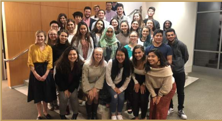
Urban Education students with young alumni teachers

Topic: International Relations: U.S. Grand Strategy in the 21st Century