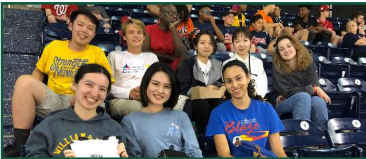
Semester students cheering on the World Champion Washington Nationals