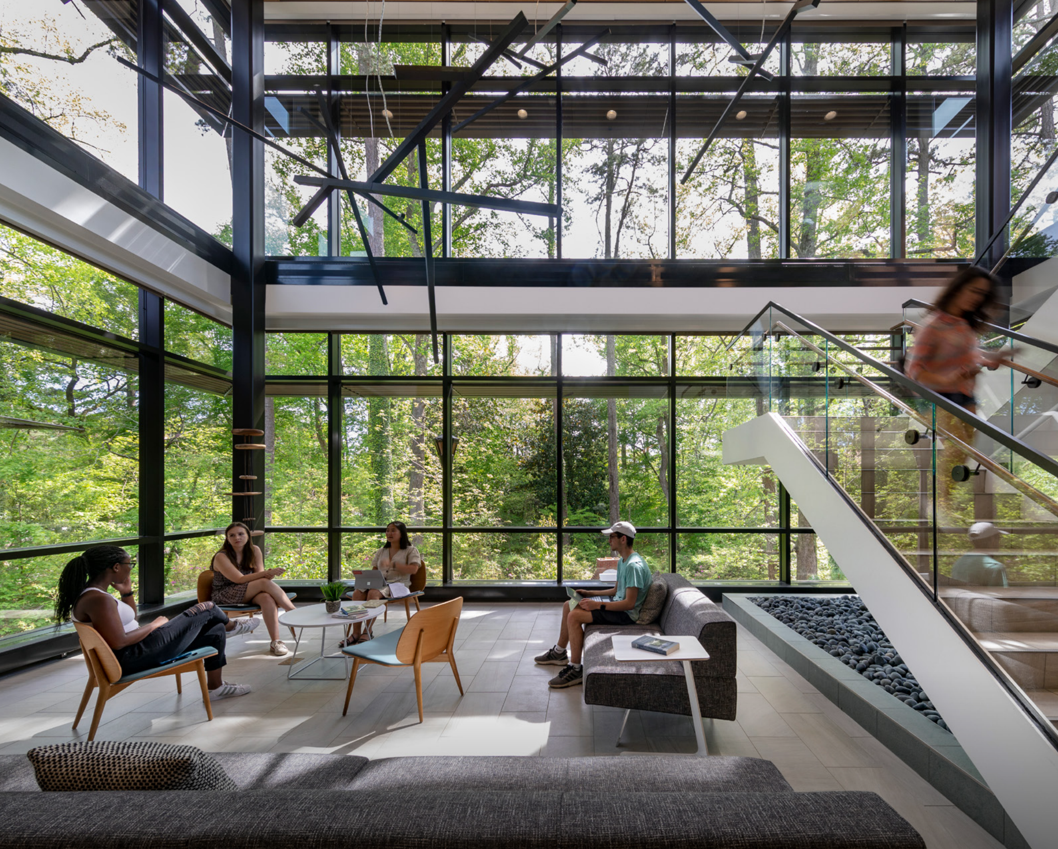
Students gather in the McLeod Tyler Wellness Center