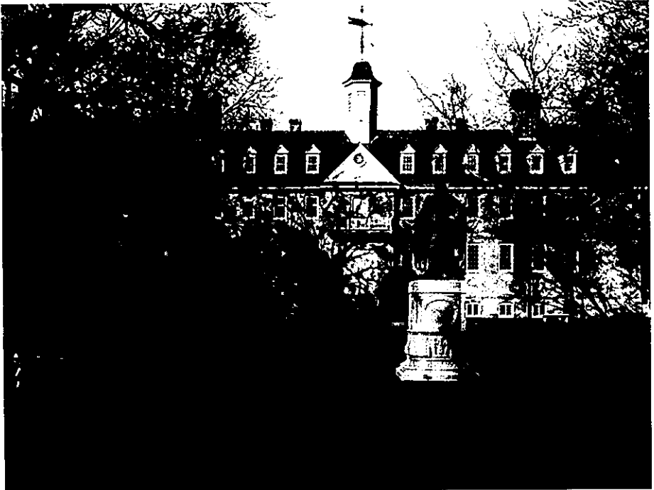
Sir Christopher Wren Building

The Historic Campus is the site of three restored pre-Revolutionary buildings. The Sir Christopher Wren Building (1695, restored 1928-31), still in daily classroom use, is the oldest academic building in the United States. The Brafferton (1723, restored 1932), originally a school for Indians established with a bequest from the English scientist Robert Boyle, today contains administrative offices. The third building, the President's House (1732, restored 1931), has served as home for each of the twenty-five presidents of the College.